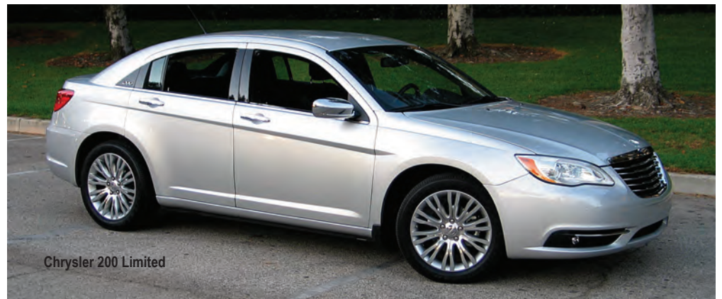
Chrysler 200 Limited