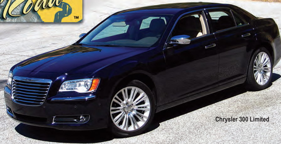
Chrysler 300 Limited