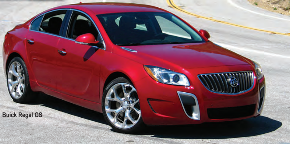
Buick Regal GS