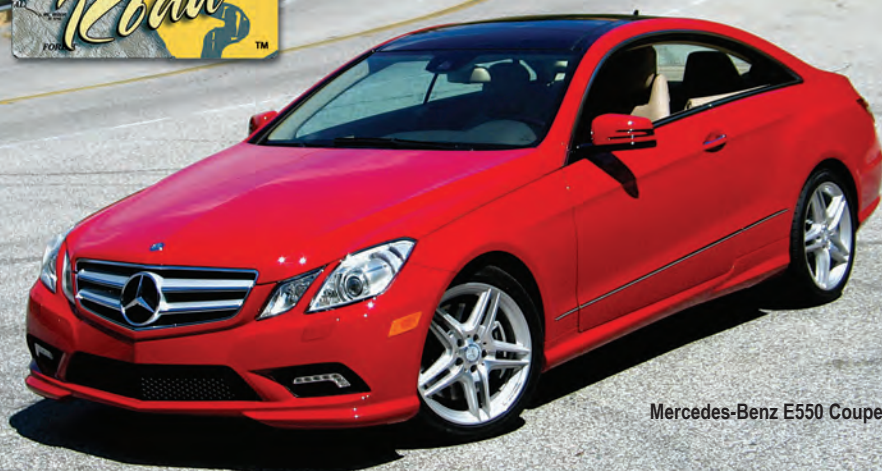
Mercedes-Benz E550 Coupe