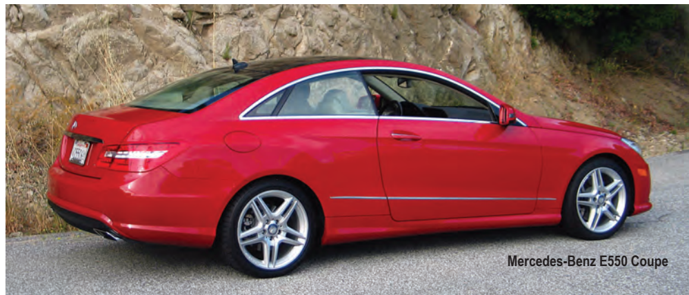
Mercedes-Benz E550 Coupe

Inside, there's lots to like. A Panorama Sunroof offers views for front and rear passengers. Perforated leather seats let you blow warm or cool air through them—part of the $6,450 Premium Package that also