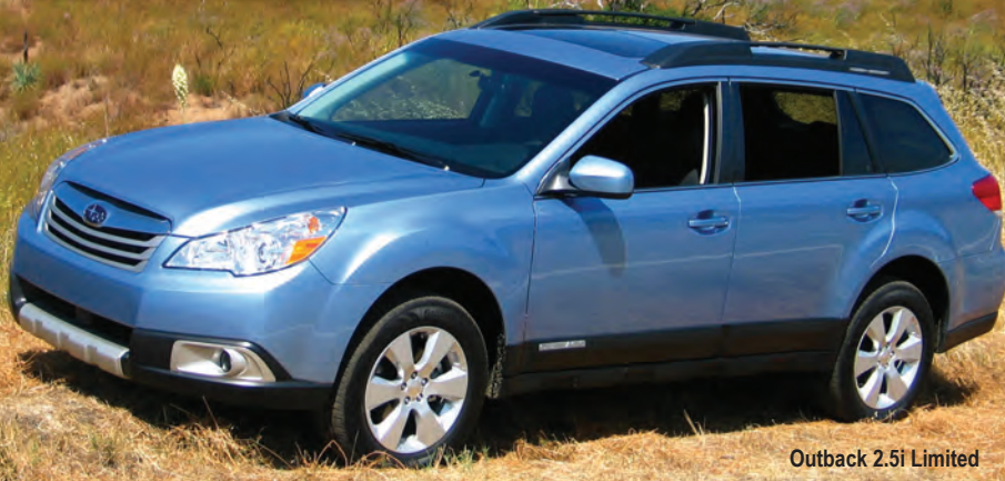
Outback 2.5i Limited