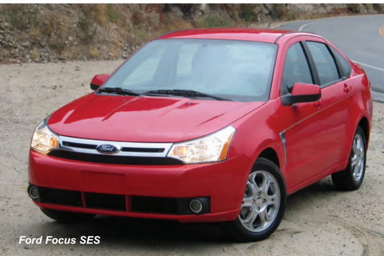
Ford Focus SES